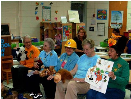
PC of Bennettsville