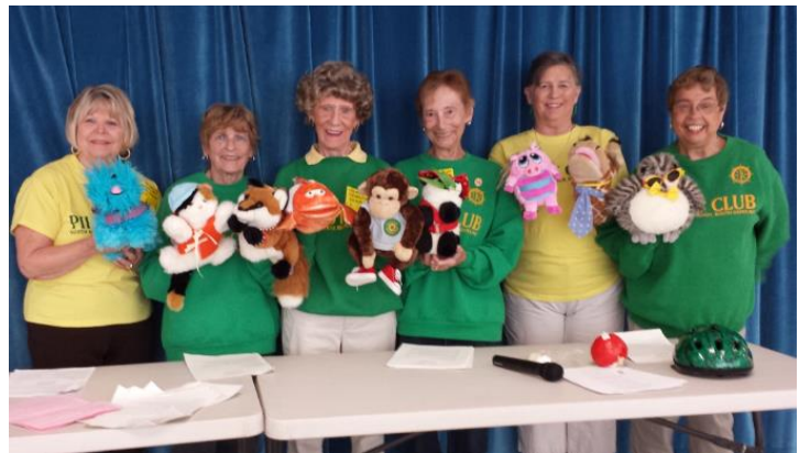
PC of North Myrtle Beach